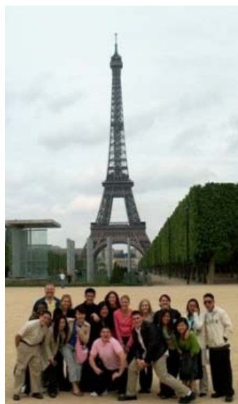
IBEC members can be found all over the globe!

So far, IBEC has helped students explore business practices in England, France, Germany, Poland, The Czech Republic & Guatemala . This spring BCC students will travel to Japan to compare business strategies of