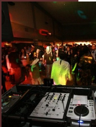
2010 Halloween dance.

As radiant and cloudless days have dwindled while our late-night studying now stretches past midnight, lets not forget that Bellevue College's myriad of events this Fall will keep your minds at ease and your days full of entertainment.